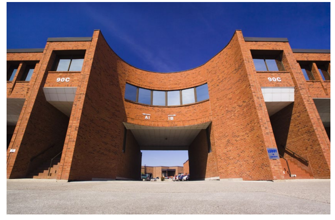
80-90 Centurian Drive, Markham, ON

CIP had a strong quarter of leasing activity at 80 and 90 Centurian Drive, Markham, ON. Among the notable transactions were securing a third-party logistics company to occupy a 12,295 square foot industrial vacancy, renewing an office tenant for 2,448 square feet and placing a fitness-related use into 3,049 square feet of flex office space. Currently 94.0% occupied and housing 40 tenants, the property comprises 83,304 square feet of industrial space, 50,059 square feet of office space and caters to smaller format users. The asset is well located with quick access to highways 7, 404 and 407.